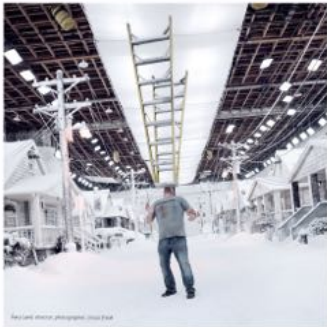
Two Level Group